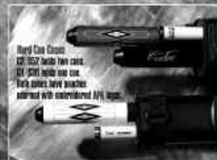
Hard Core Cues 01-057 holds two cues 01-030 holds one cue Both cues have punches stained with embedded APA logo.